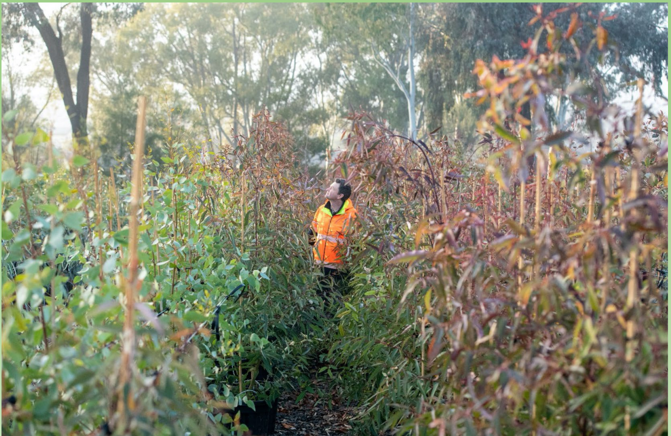
Above: Nursery Team Leader, Matt Miller inspects the nurseries advanced tree stock to ensure it is ready for the Greening Greater Bendigo planting program.

The City continues to increase the number of trees grown internally for the street tree program. It is on track to reach its goal to start planting 1,500 trees grown from the nursery each year.