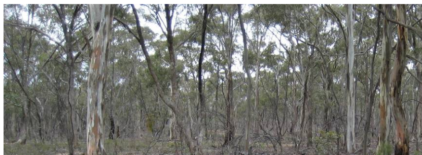
Box ironbark in Shelbourne Nature Conservation Reserve

It is recognised that while the district has a long association with agricultural production in recent years with smaller allotments the population has increased substantially and will continue so for a number of years. The Community Plan identifies areas of Community infrastructure which require updating to accommodate the increase in community numbers