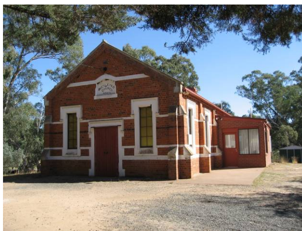
Uniting Church - Lockwood South

In addition the effects of climate change and rising fuel costs should be addressed as an issue for decision makers as well as the whole of community.