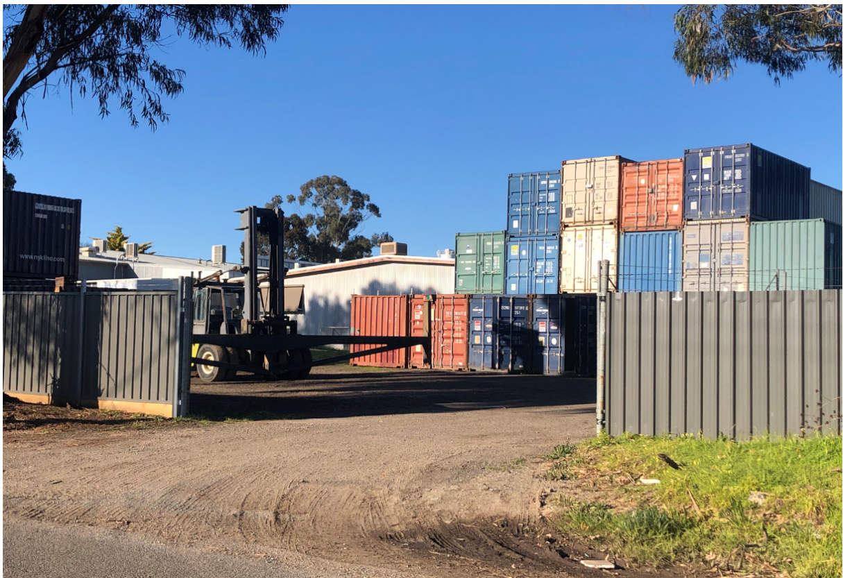
Figures 3 and 4: Photos of the subject site as viewed from Crowther Street