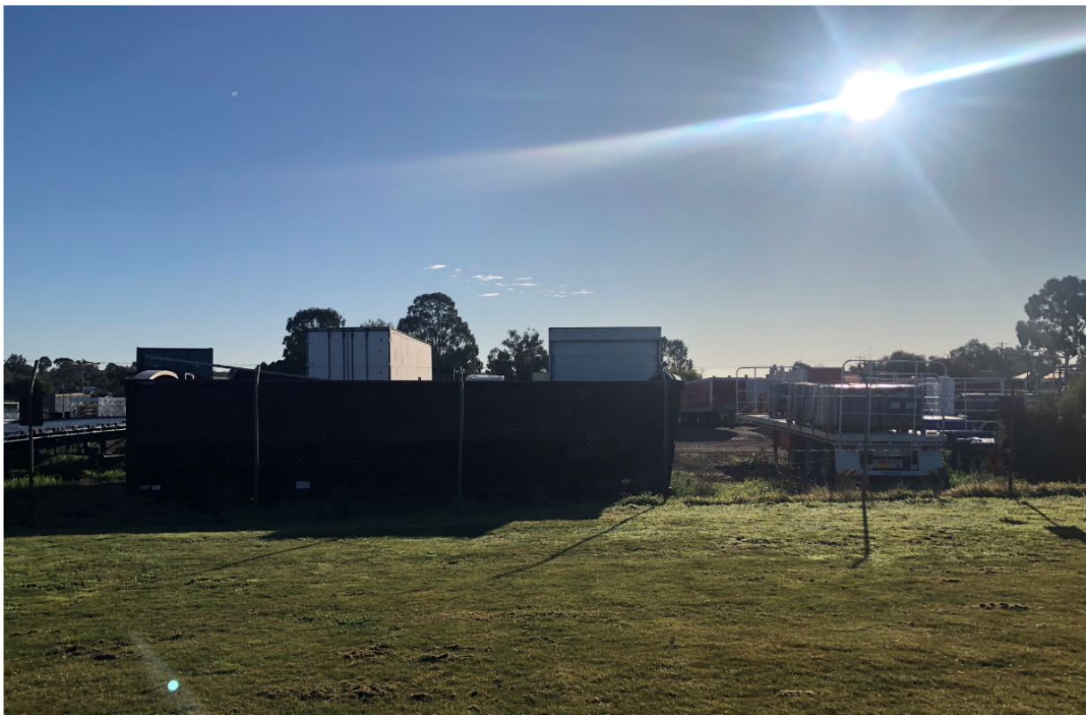
Figures 5 and 6: Photos of the site as viewed from Albert Roy Reserve.