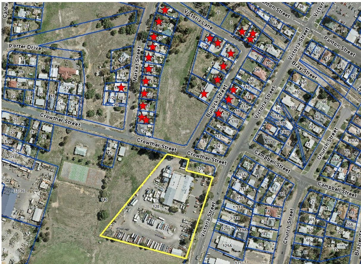
Figure 8: Location map showing subject site. Objectors' properties are marked with a star.