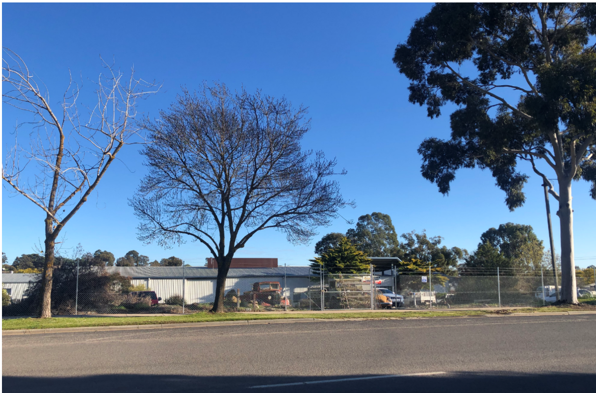
Figures 1 and 2: Photos of the subject site as viewed from Victoria Street