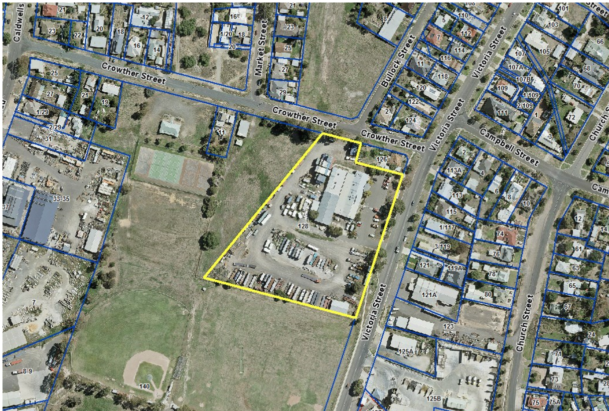
Figure 7: Aerial map showing subject site